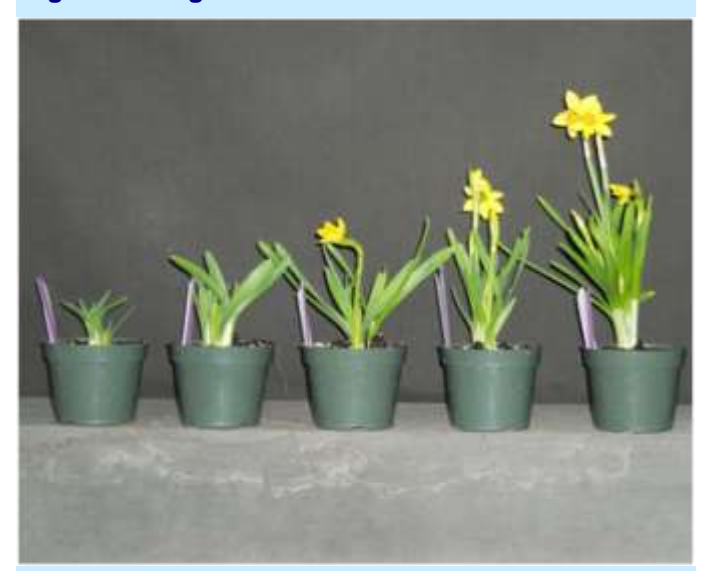
Fig. 12. Tete-a-Tete. All plants had 4 weeks of 9C then 8 weeks of 1C to simulate a cold cooler. Then, plants had (left to right): 0, 1, 2, 4 or 6 weeks of ending 10C. Image 7897.