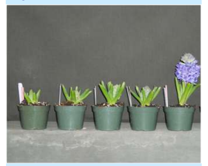
Fig. 10. Blue Jacket. All plants had 4 weeks of 9C then 8 weeks of 1C to simulate a cold cooler. Then, plants had (left to right): 0, 1, 2, 4 or 6 weeks of ending 10C. Image 7896.