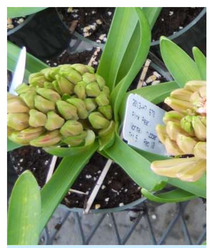
Fig. 5. Example of two rubber bands being used to stop hyacinth heaving. Image 2925.