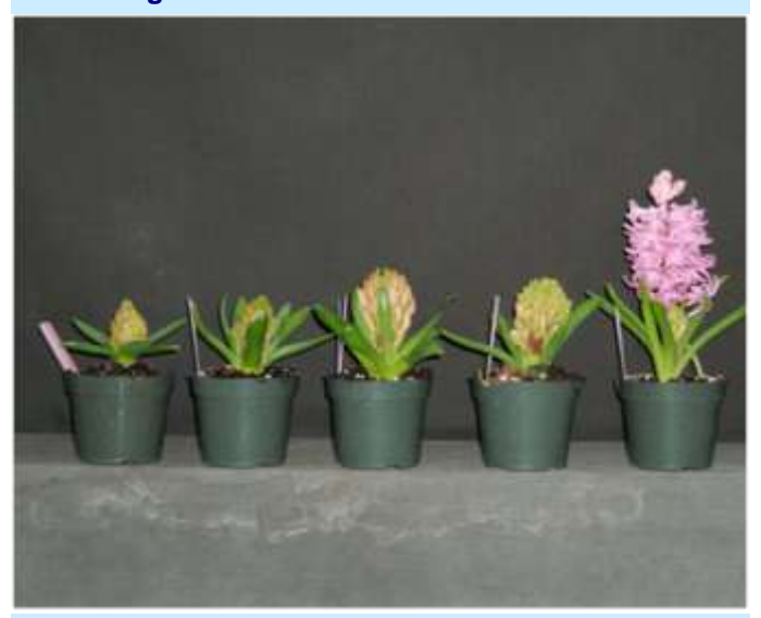
Fig. 11. Pink Pearl. All plants had 4 weeks of 9C then 8 weeks of 1C to simulate a cold cooler. Then, plants had (left to right): 0, 1, 2, 4 or 6 weeks of ending 10C. Image 7894.