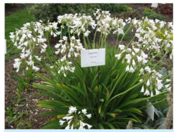
Fig. 6. Agapanthus 'Sea Foam', which has survived 10 winters in Ithaca NY (Zone 5). Image 0093.