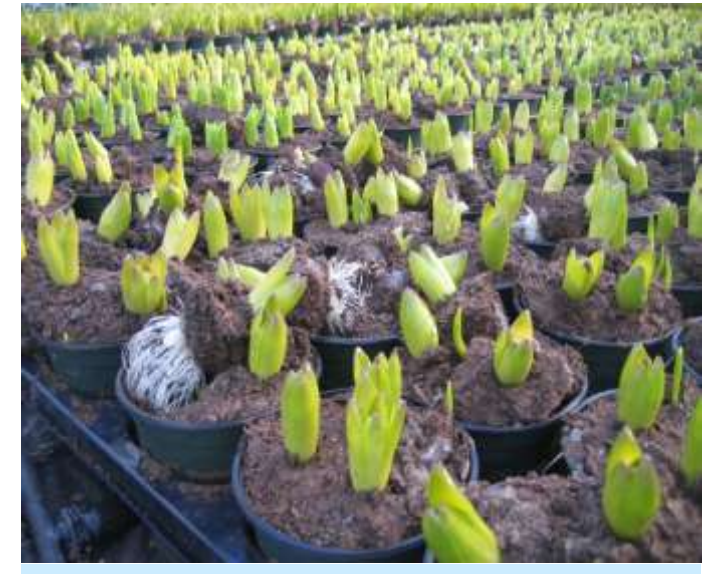
Fig. 1. Commercial hyacinth with heaving problems. Image 5000.