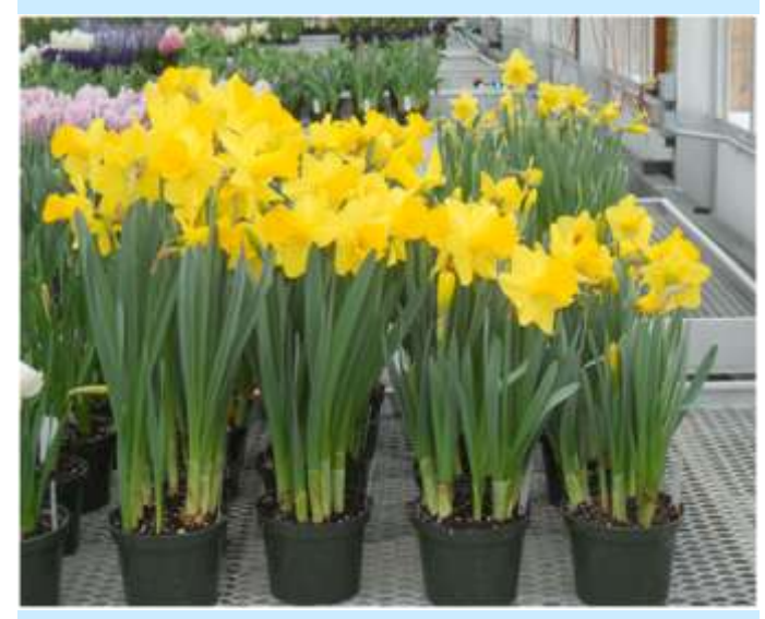
Fig. 13. Primeur plants drenched in the greenhouse with L to R: 0, 100, 250, 500 ppm ethephon (using Florel). Image 7240.

Fig. 11. Pink Pearl. All plants had 4 weeks of 9C then 8 weeks of 1C to simulate a cold cooler. Then, plants had (left to right): 0, 1, 2, 4 or 6 weeks of ending 10C. Image 7894.