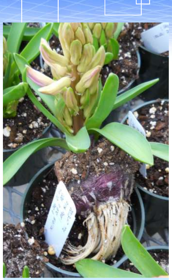
Fig. 4. 'Pink Pearl' heaving, shallow planted bulb, soil surface sprayed with glue. Note soil glued to the top of the bulb. The glue did not help. Image 2919.