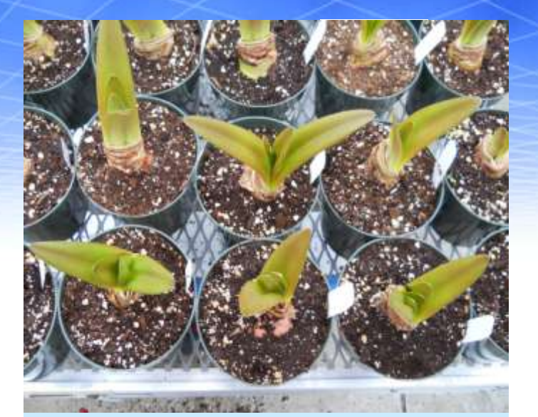
Fig. 8. Amaryllis Samba, soaked for 12 hours in room temperature water before planting soaked. Photo taken at the same time as the one above. Image 2649.