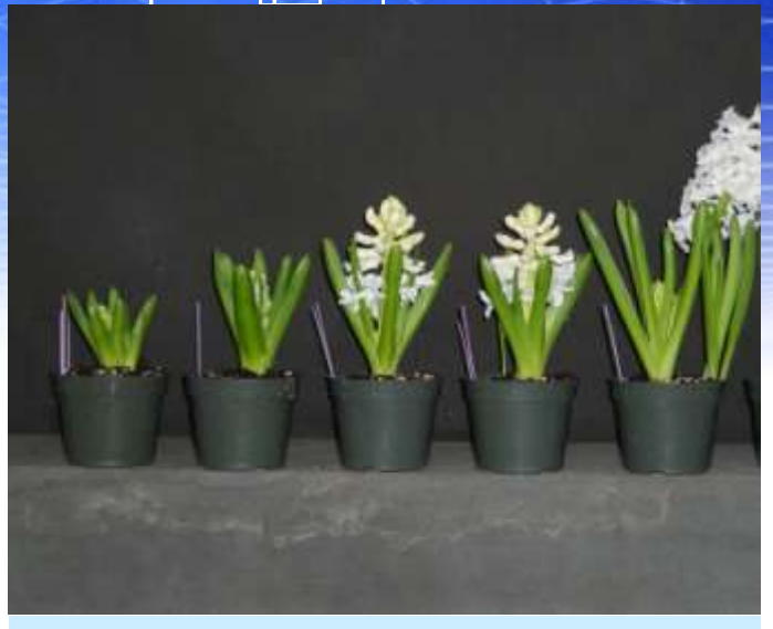
Fig. 9. Aiolos. All plants had 4 weeks of 9C then 8 weeks of 1C to simulate a cold cooler. Then, plants had (left to right): 0, 1, 2, 4 or 6 weeks of ending 10C. Image 7895.